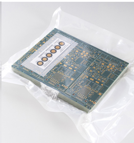
STANDARD PACK + PE PLASTIC VACUUM BAG