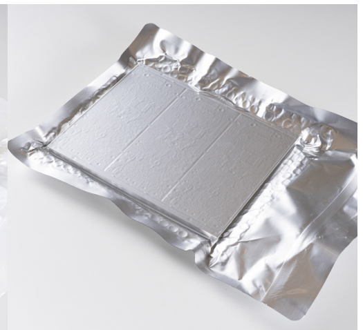
STANDARD PACK + MOISTURE BARRIER BAG